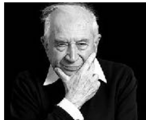
PROFESSOR RAPHAEL MECHOULAM HEBREW UNIVERSITY, JERUSALEM