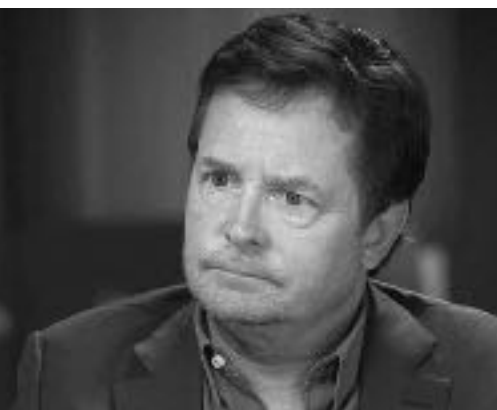
MICHAEL J FOX ACTOR & CANNABIS OIL ADVOCATE